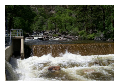
The diversion dam at our Intake Facility in Big Goose Canyon.

All of the water we provide to you comes from creeks, streams, lakes, and reservoirs in the Big Horn National Forest's Big Goose drainage. Sheri-